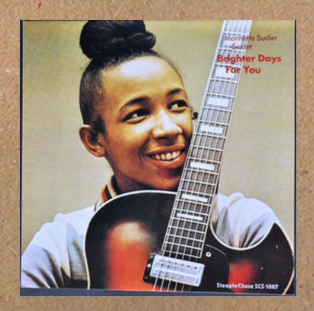
Brighter Days for You